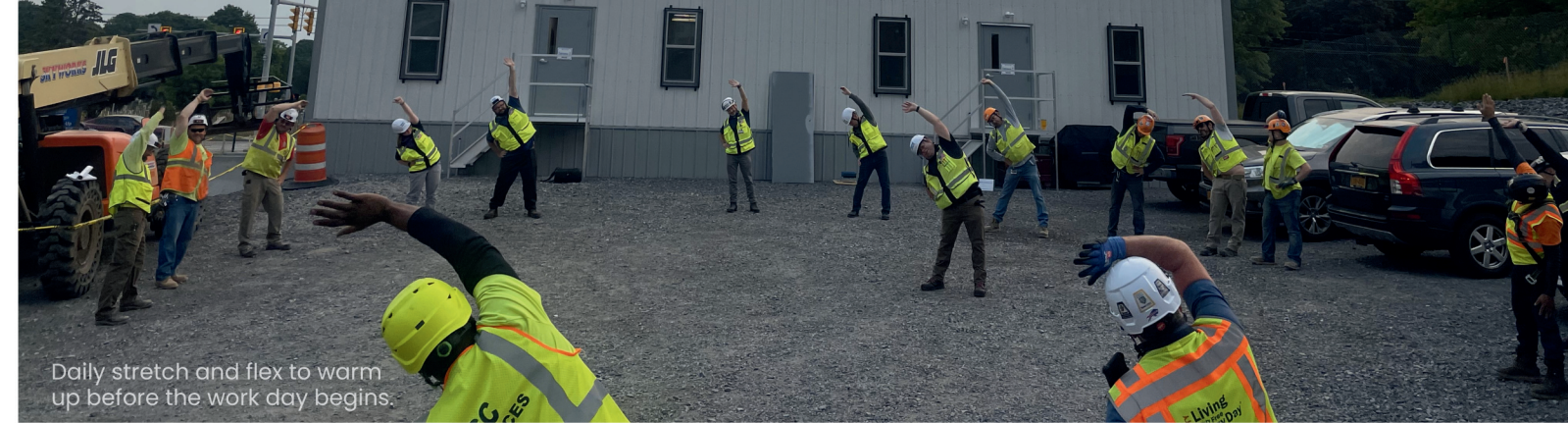
Daily stretch and flex to warm up before the work day begins.