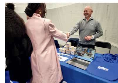
Greeting youth at the Urban League of Rochester Annual Black Scholars Recognition Event

Turner | Pike is the joint venture team acting as Construction Manager for the University of Rochester on this $400M project slated to run through 2028 (completed new build rendering pictured above). Our team is committed to bring about foundational change in the region through workforce inclusion and development, community outreach, and youth engagement. In addition to the advancement of economic viability, we are committed to health equity as this project is after all increasing the capacity in which healthcare can be provided to the community.